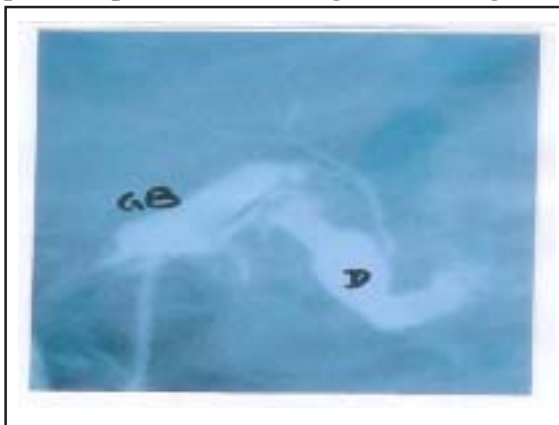
Fig. 3 Normal operative cholangiogram (D – duodenum)