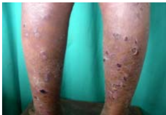
Fig. 2 Deeper crusted lesions of ecthyma with eroded areas on the legs