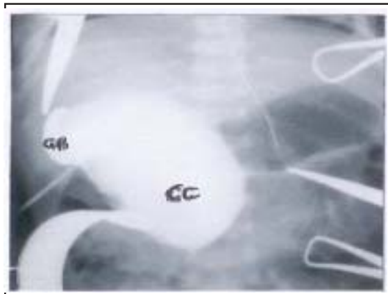
Fig. 4 Operative cholangiogram. Choledochal cyst (cc) with no contrast in the duodenum.

in infants less than three months of age with features of NCS and adequate hepatic function. In children with prolonged cholestasis beyond this age hepatocellular function is too poor for tracer uptake and it is impossible to differentiate between neonatal hepatitis and biliary atresia. Hence hepato-biliary scintigraphy will not be helpful when liver function has deteriorated.