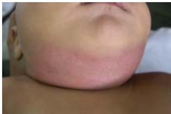
Fig. 4 Cellulitis on the neck showing a tender erythematous inflamed swelling with well defined margins