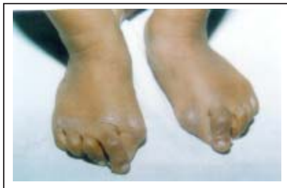
Fig. 2 Hallux valgus

thumbs. Awareness of the association clinches the diagnosis. The most common sites of heterotopic calcification are the neck, spine and shoulder girdle. The pattern of progress is from axial to appendicular, cranial to caudal and proximal to distal 5 . Lesions follow different stages on its progress; they are, stage of inflammation (pain, erythema, swelling, warmth and tenderness), intermediate lesion and a late irreversible ossified lesion 6 . Radiography shows ectopic calcifications. Trauma to deep muscles is a stimulus for ossification (e.g. immunization). Lesions must not be biopsied as it aggravates the process of calcification and the child must be protected from even most trivial trauma. Debilitating joint immobility due to ossification of almost all joints is the ultimate outcome on account of the progressive nature. Most of the patients are confined to wheel chair by third decade of life and often succumb to pulmonary complications in the fifth or sixth decade of life 3 . Extraocular, diaphragm, cardiac and smooth muscles are characteristically spared. Premature death can occur from respiratory failure due to thoracic cage involvement 5 . Till date there is no definite therapy to impede the progression of disease. Oral steroids and etidronate have some