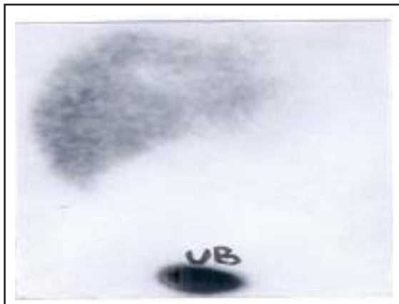
Fig. 2 Hepatobiliary scan. There is no opacification of the GB in a case of biliary atresia. Note the tracer in the urinary bladder.