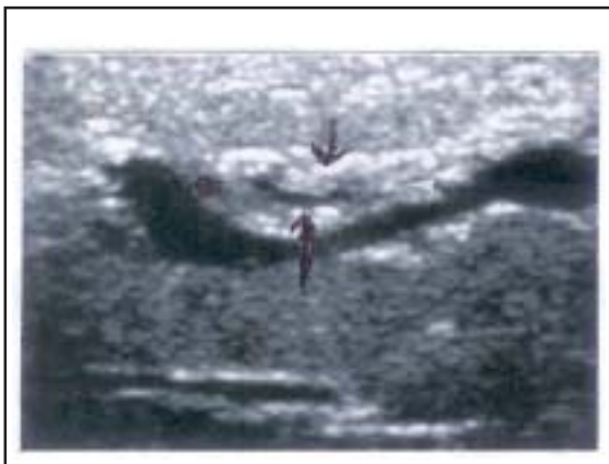
Fig. 1 A highly magnified view of the porta-hepatitis. The triangular cord sign.