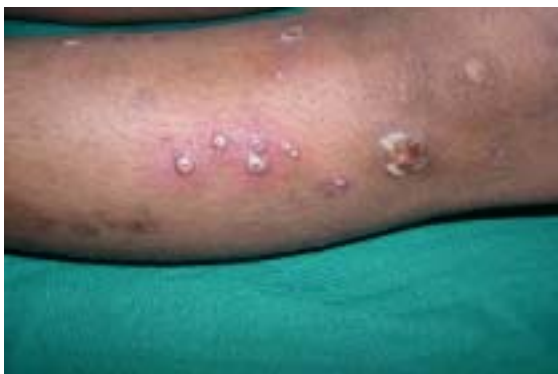
Fig. 3 Follicular pustules on an erythematous base with central necrosis and crust