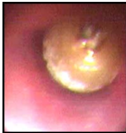
Fig 1. Upper GI scopy shows a whole green grape in the mid esophagus

Foreign body in the aero digestive tract is a common problem in children. In the normal oesophagus the common site of impaction is the