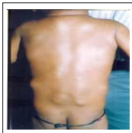
Fig. 1 Two year old child showing multiple swelling in back